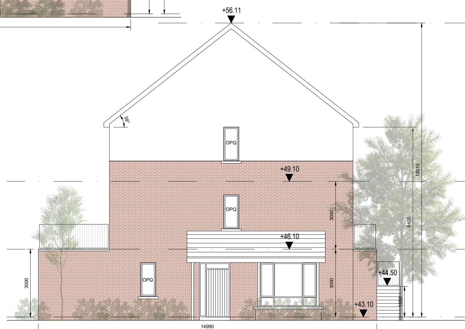
SOUTHEAST ELEVATION (D2A/B)